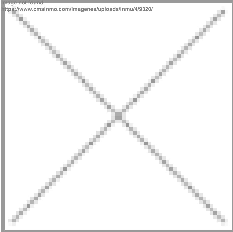
Image not found https://www.cmsinmo.com/imagenes/uploads/inmu/4/9320/