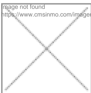
image not found https://www.cmsinmo.com/imagenes/uploads/inmu/4/3483/Superb_value_townhouse_with_great_v