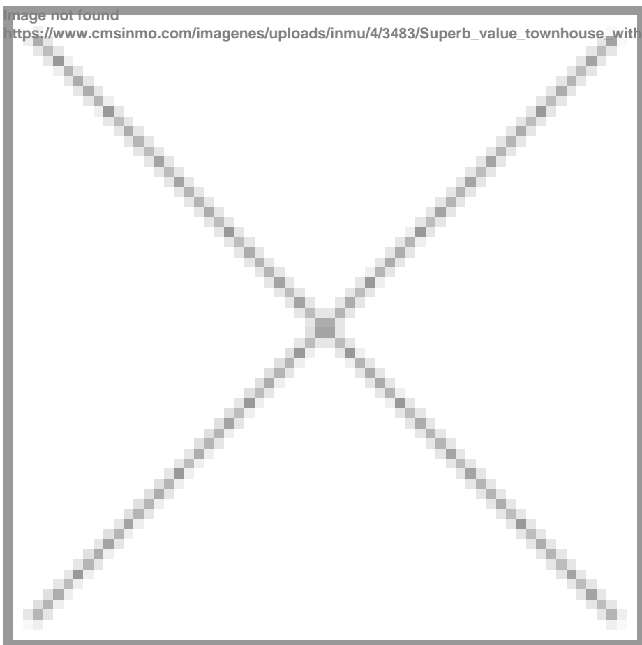
image not found https://www.cmsinmo.com/imagenes/uploads/inmu/4/3483/Superb_value_townhouse_with_great_v