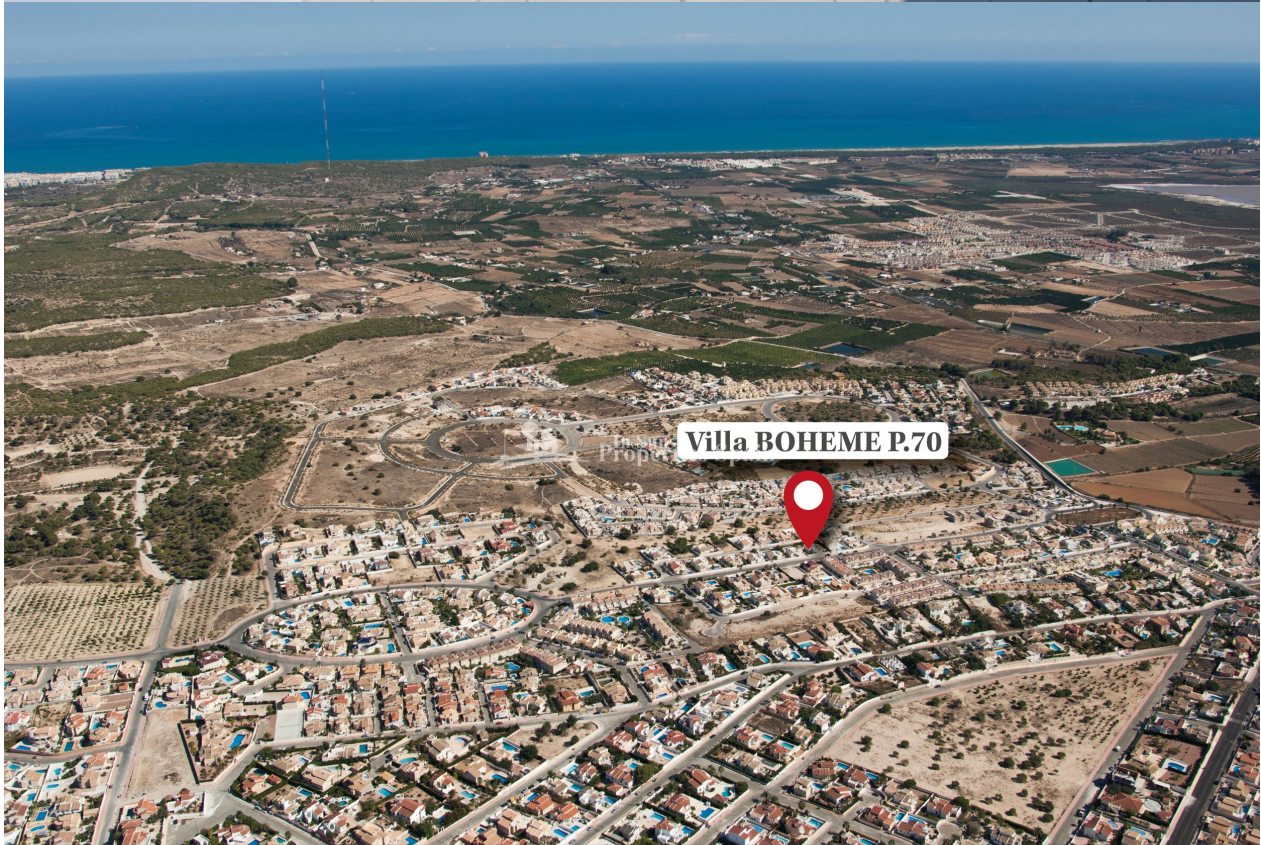
La Fiesta I-II Aerial View