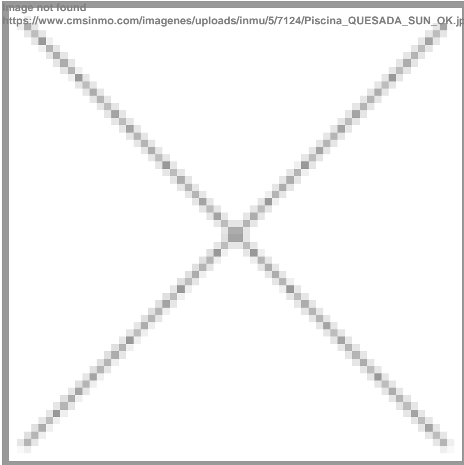
image not found https://www.cmsinmo.com/imagenes/uploads/inmu/5/7124/Piscina_QUESADA_SUN_OK.jpg

ROJALES (GOLF LA MARQUESA (CIUDAD QUESADA))