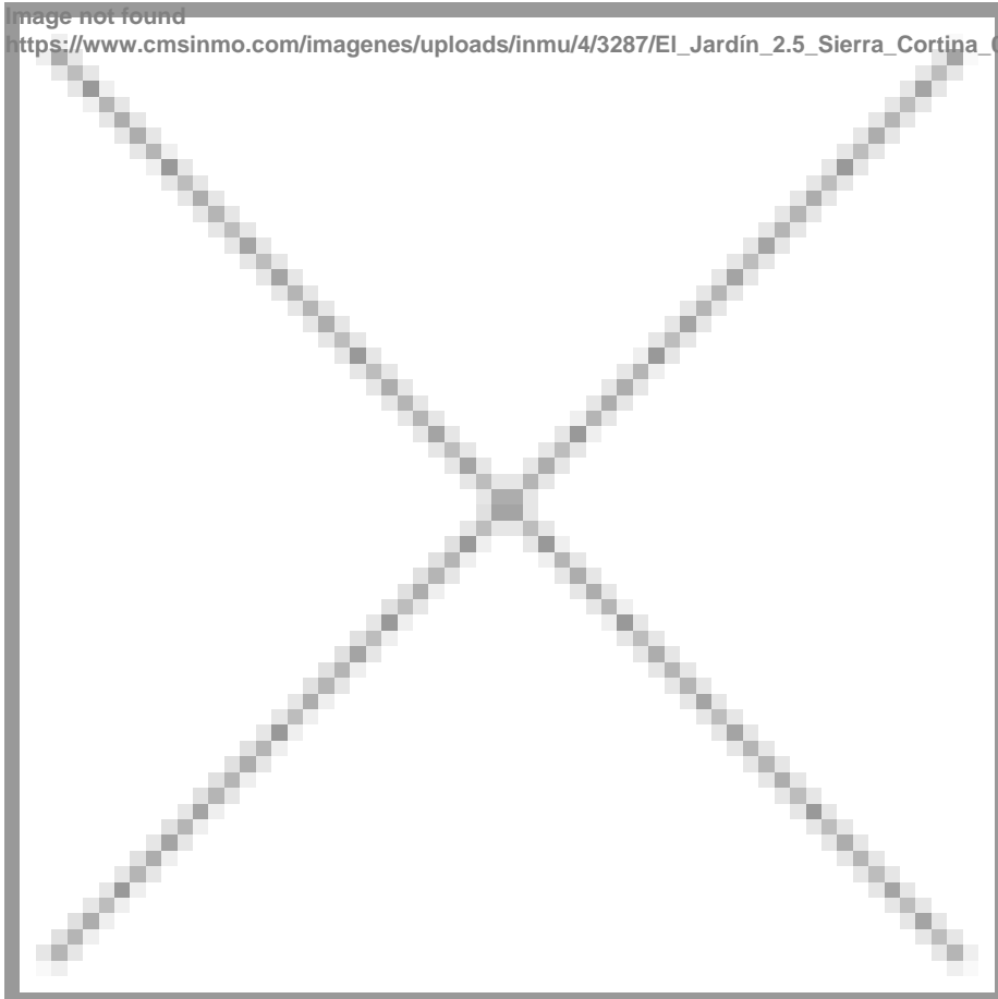
Image not found https://www.cmsinmo.com/imagenes/uploads/inmu/4/3287/El_Jardín_2.5_Sierra_Cortina_08_.JPG